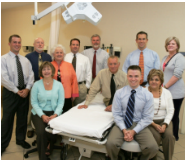
Pictured Left to Right: